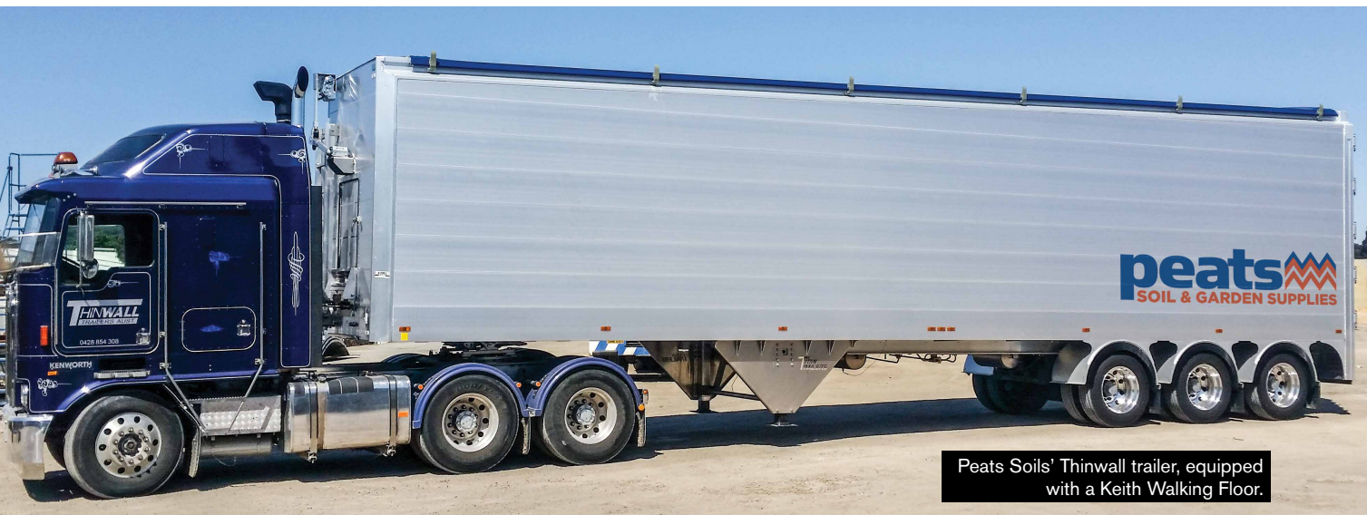
Peats Soils' Thinwall trailer, equipped with a Keith Walking Floor.